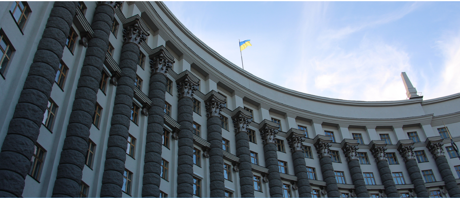
UKRAINIAN GOVERNMENT BUILDING